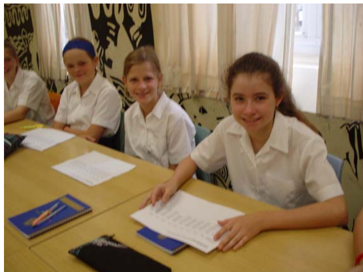
Welcome to Year 7 of 2006!