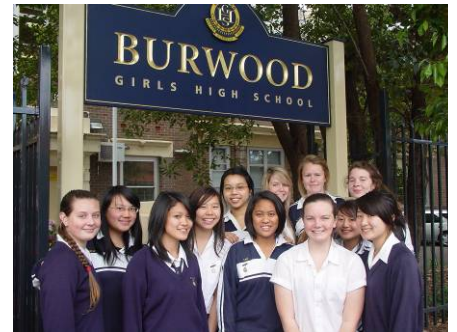
Fond farewell to the front gate!